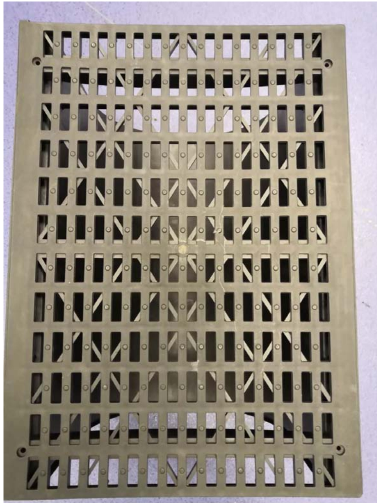
Fig. 3 Picture of sample after load-bearing test