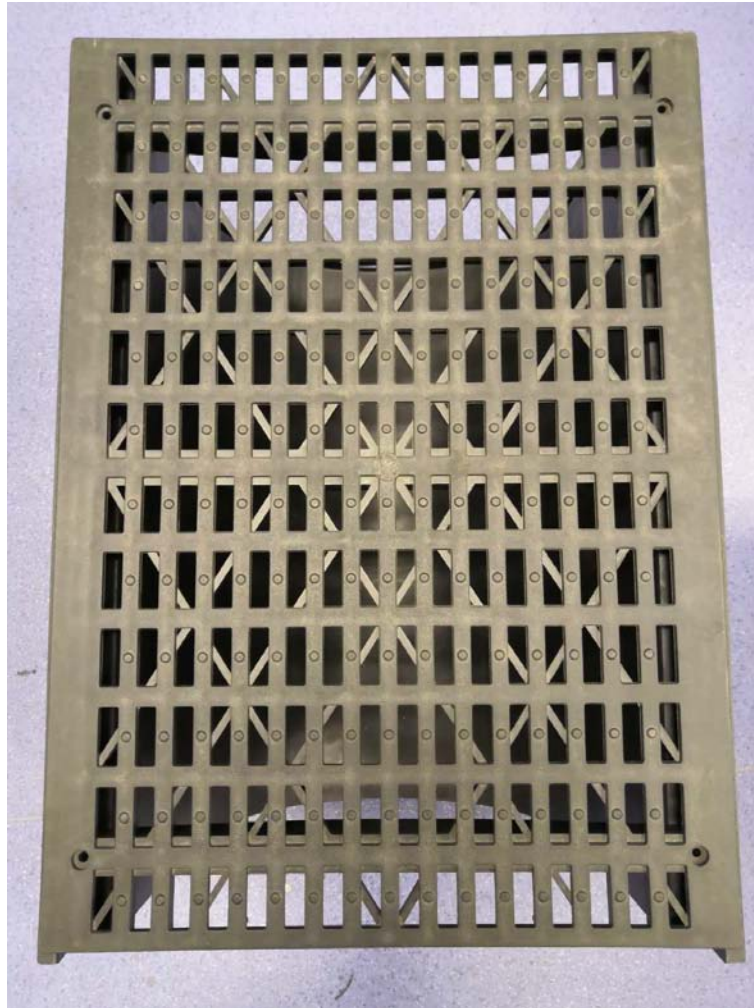
Fig.1 Picture of sample before load-bearing test