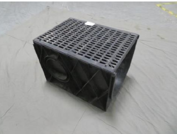
Fg.2 Pictures of sample before load-bearing test *** End of the Page ***