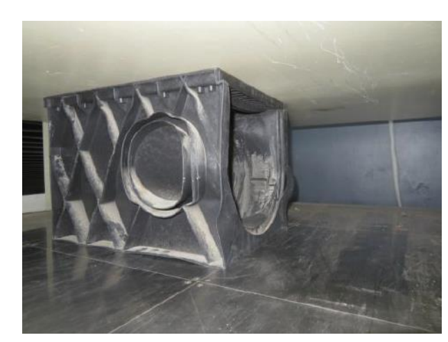
Fg.3 Pictures of sample during load-bearing test