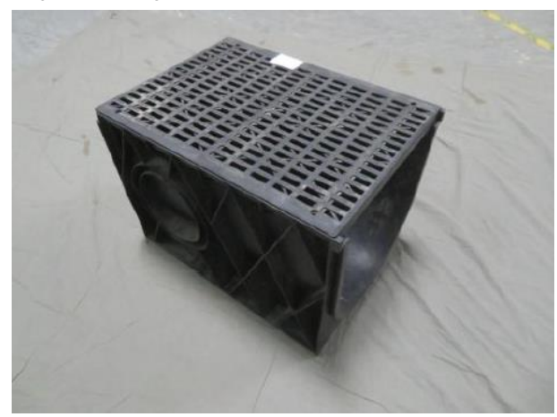
Fg. 4 Pictures of sample after load-bearing test *** End of the Page ***